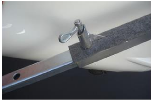
...and check the locking of the bolt head at the tube. Open the spring-loaded lever and move out the bar.