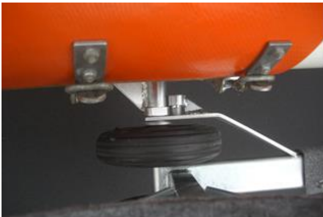
Then lower the towing end to the ground...