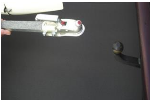
Bring your car close...