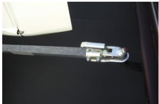
...and hook it on...