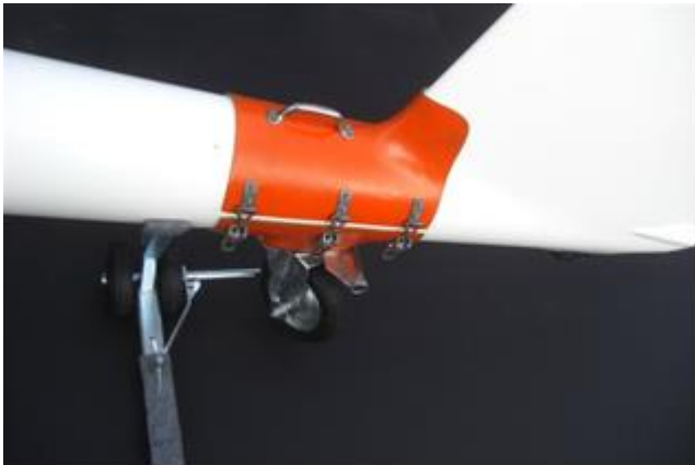
Attach the tail dolly. Lower it to the ground...