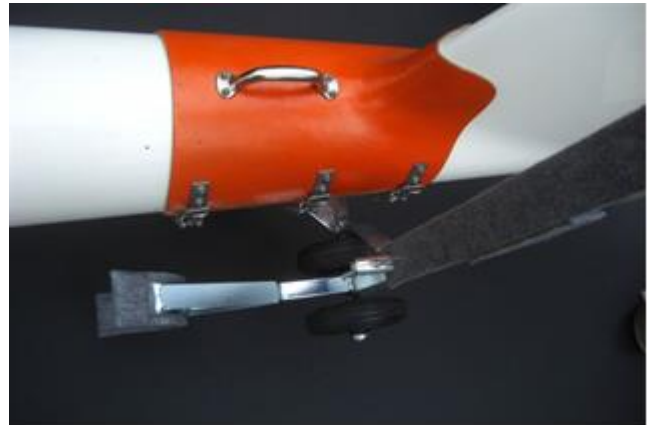
... and plug the pin of the tow bar into the tube at the dolly in a vertical position.