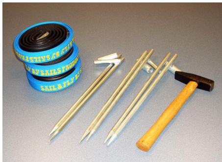
Scope of delivery